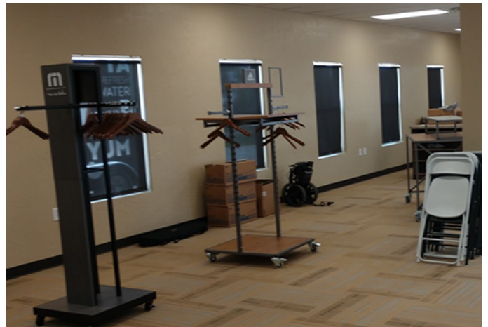
**Photos are not representative of specific asset, they are example only